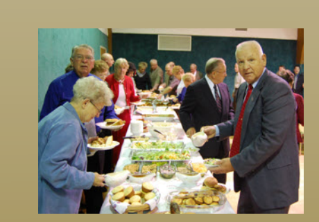
Faith Baptist Church served the finest meals throughout the meeting